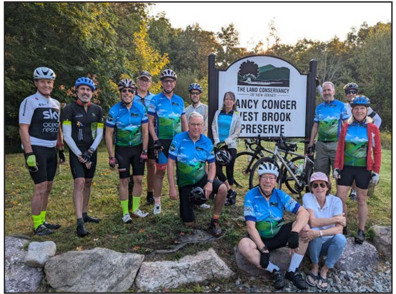
The 2024 Land Conservancy Fondo riders.

Between the riders and other supporters, we also raised $7,000 to preserve more of these beautiful places we rode past! While we miss the Garden State Fondo that inspired the Land Conservancy ride, the camaraderie and beauty of this incarnation more than makes up for the loss. Can't wait to do it again next year!